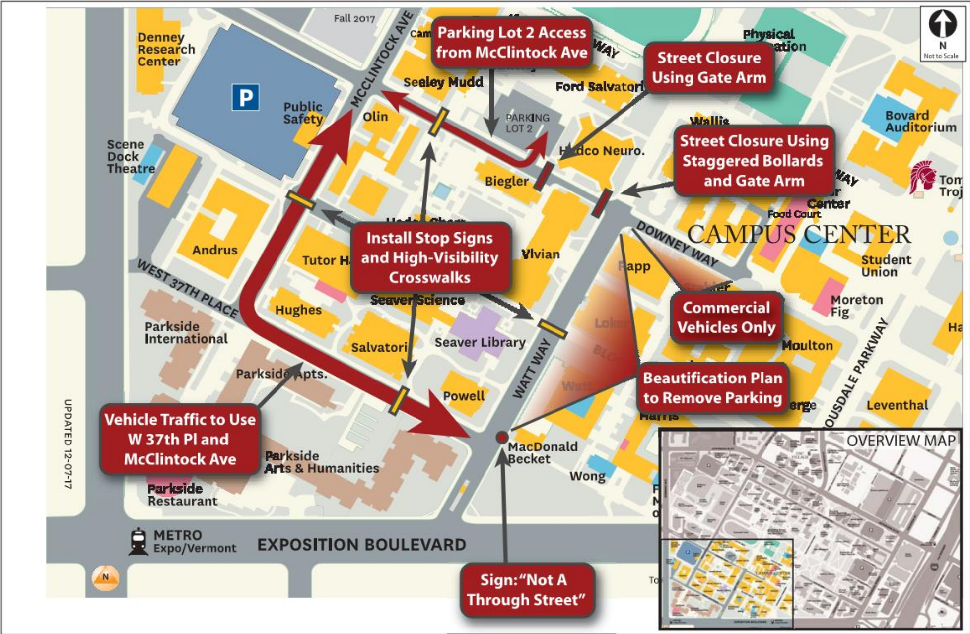
PROPOSED DOWNEY WAY CLOSURE