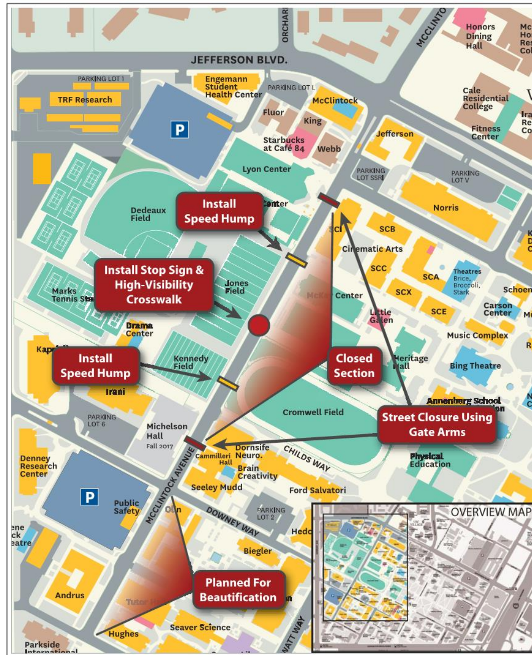
PROPOSED MCCLINTOCK AVENUE CLOSURE